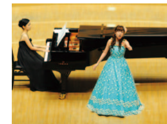
● Gathering of young musicians from all over Japan Echo of Exchange