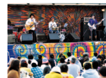
● Nagesen-type (money donated by spectators) outdoor festival Keihin Rock Festival