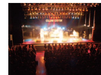
● Competition between musicians Kawasaki Street Music Battle