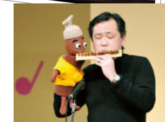
● Gathering of unique musical instruments National Handmade Music Instrument Idea Contest