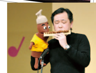
● Gathering of unique musical instruments National Handmade Music Instrument Idea Contest