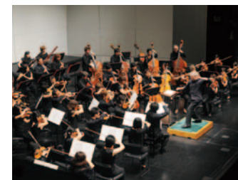
● Performances by nine orchestras Festa Summer MUZA