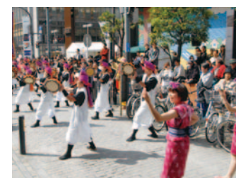
● Two-day all-Asian music event Asia Exchange Music Festival