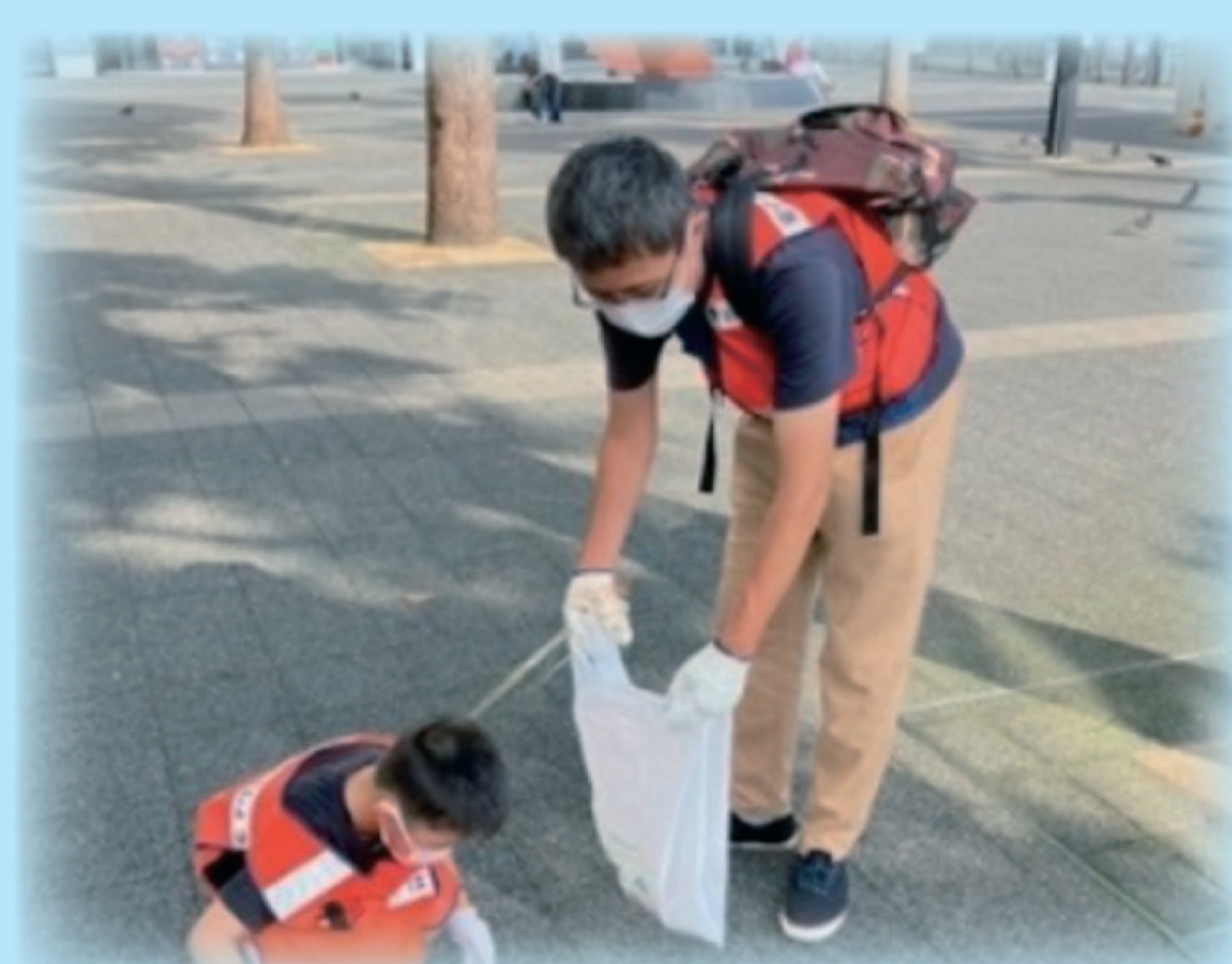
Promoting environmental beautification activities

In addition to promoting the proper disposal of waste, Kawasaki City has implemented various measures to promote the 3Rs, such as public awareness campaigns, environmental education, and citizen participation. We will continue to promote these initiatives while capturing the growing momentum related to plastic waste in recent years. New initiatives such as the "Kawasaki Plastic Recycling Project" will be promoted in collaboration with environmental industries and other organizations for a better future.