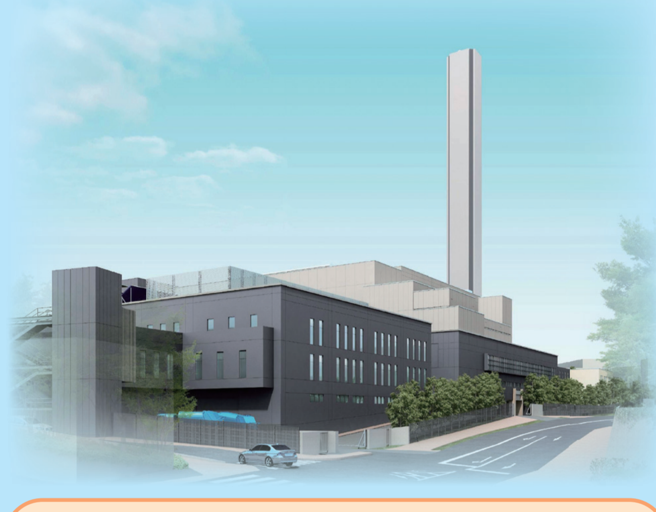
Promoting further proper treatment at the new Tachibana Treatment Center