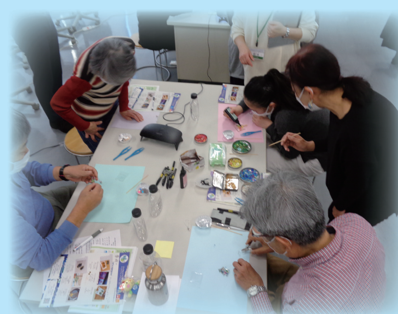
Making keychains using microplastics at "Zero Garbage Cafe"