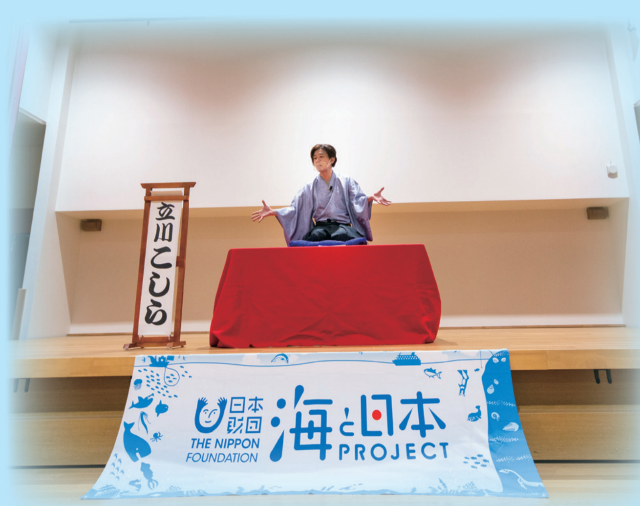
3R Lecture Learning about marine litter problems through rakugo, traditional Japanese comic storytelling