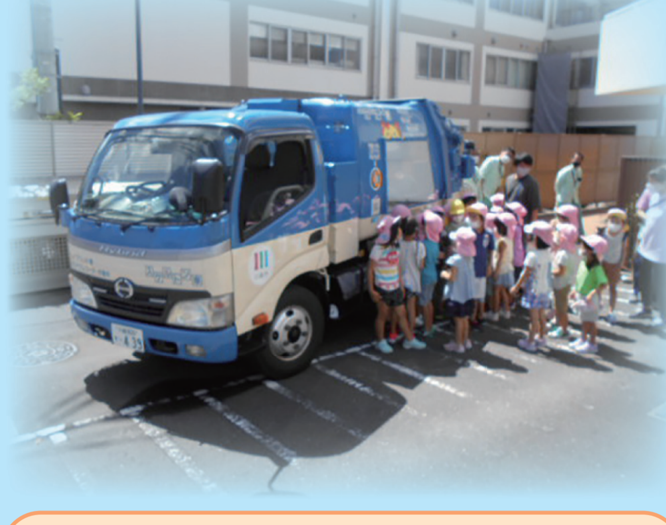
Environmental learning through the "Fureai On-site Course"