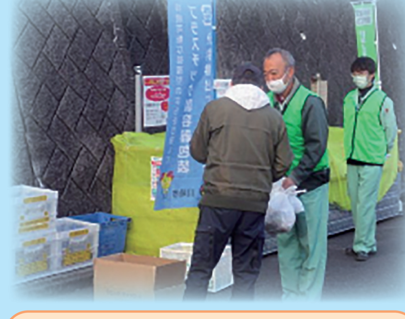
A call for Proper Emissions