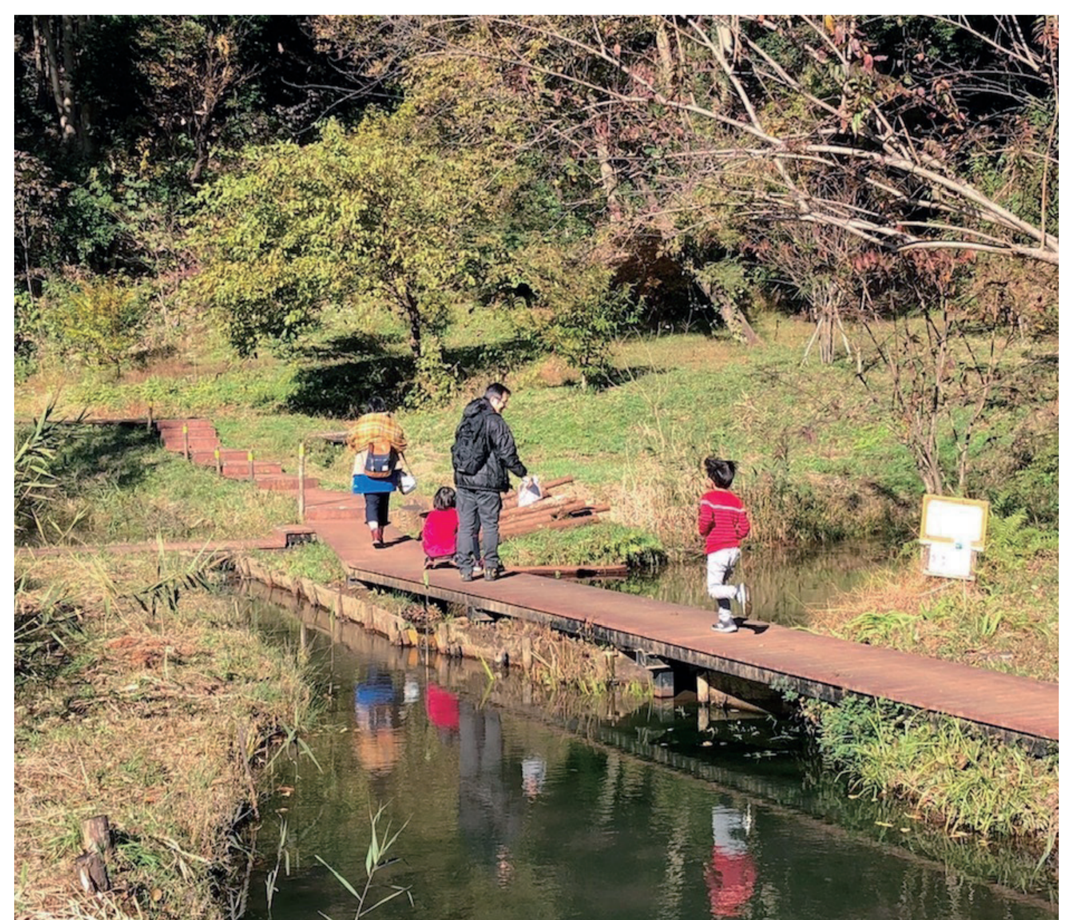
Satoyama scenery (Kurokawa Yokomine Special Nature Preserve)

In the northwest of Kawasaki City, the scenery of former "satoyama" remains. "Satoyama" are areas of protected ecosystems. Many of the "satoyama" in the city are maintained by citizens and various organizations but has become continually difficult due to the aging population and the lack of successors. To counter these issues, we are creating opportunities for people to experience a good, well preserved natural environment.